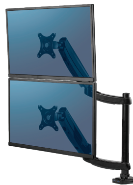
Platinum Series Dual Stacking Monitor Arm Office Depot Item #524631