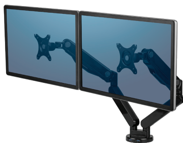
Platinum Series Dual Monitor Arm Office Depot Item # 219092