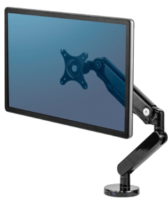
Platinum Series Single Monitor Arm Office Depot Item # 923759